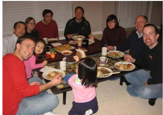
Hosting my Regional Leadership Team at my home: in St. Louis: (Some of the many guests we've hosted this past year)

It's June - time to reflect on the school year and assess our ministry. Most of what my Regional Leadership Team is doing now is celebrating . After launching our new Regional Vision, I'm proud of the team's leadership and our campus missionaries who have worked hard and seen tremendous results. Please do celebrate with us what God has done in students lives across the region!